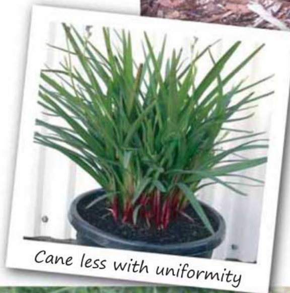
Cane less with uniformity

Aranda thrives in sandy loam, clay loam, free draining soils. It performs exceptionally in improved garden soils. It has no problems with any well composted, processed mulch type. Ideal as a tidy border plant, with a clean neat appearance in the landscape. Also a very compact plant for mass planting. It has tightly held rhizomes.