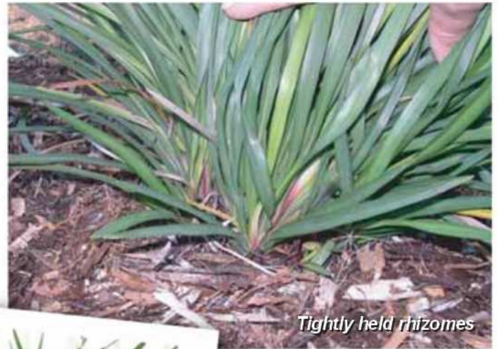
Tightly held rhizomes

Aranda is a compact, dwarf, cane less Dianella with upright to slightly arching deep green foliage and has very tight rhizome growth with a small spread. Aranda has a more or less clumping habit. It has smooth deep green semi gloss, gently arching foliage. It flowers in spring and summer with deep blue coloured flower buds and star shaped flowers held among to slightly above the foliage, this is followed by purple berries. Grows in full sun to 70% shade and grows well in coastal humidity and inland climates. Full frost tolerance yet to be tested. It has shown evergreen frost hardiness to -5°c in Windsor, NSW, with only some leaf discolouration.